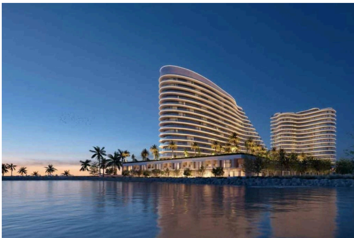
The Beach Residences exude understated resort style elegance

Having completed developments in Dubai, Al Marjan Island presented itself as the perfect canvas to craft exceptional beachside living experiences at The Beach Residences. In addition, building on the unprecedented success of The Beach Residences, another prestigious project “Beach Vista” is anticipated to be launched in 60-90 days.